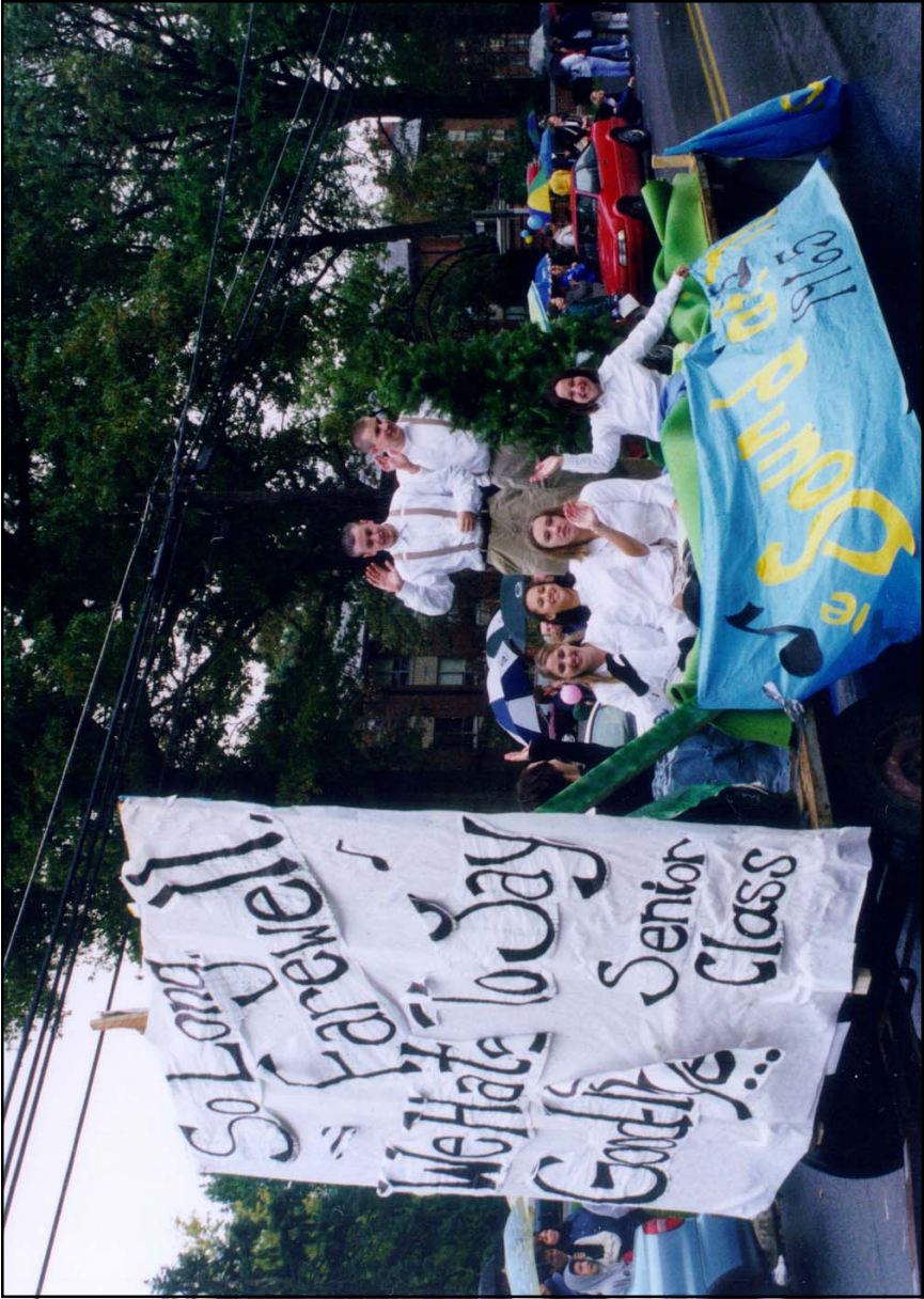
The Homecoming parade through Elizabethtown each October provides students and the community a chance to celebrate and get to know each other better.